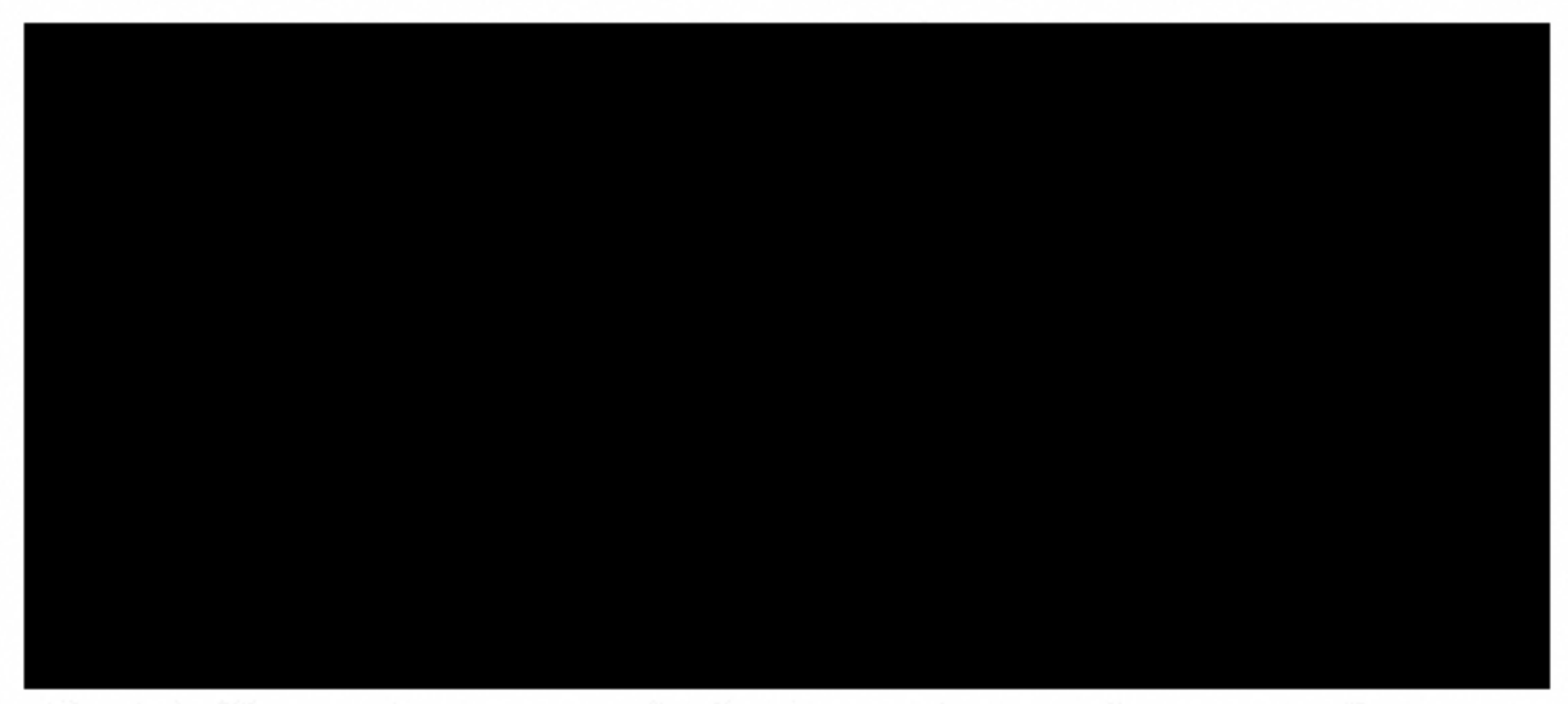
Fig. 1,2. The tangle represents the fundamental nauseating process that occurs in our consciousness but is hardly visible. (There are three smaller tangles that will be explained later.) The curved lines (at the points of the arrows) represents the level of feeling until where the process is anesthetized. In fig. 1 there is suffering because the process is partly visible (i.e., above the level; think of feeling as an opaque liquid). In fig. 2 the level of feeling is exactly at the threshold to hide the process. This results in desire. One feels pleasant, but because of the changeability of the process continuous action is necessary in order to keep it covered. The thick arrows represent the dependence of feeling on external circumstances and our volition to manipulate these.

we have to perform actions that produce feeling in order not to see the process. The existence of the process and our necessity to hide it is the driving force behind all inhumanities a human being can commit. It is the very cause of war.